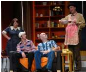
Run for Your Wife

Tibbits Summer Theatre was made possible through grant support from the Michigan Council for the Arts and Cultural Affairs Popcorn Theatre was made possible through support from McDonald's of Branch and Hillsdale Counties and the Capri Drive-In Theater