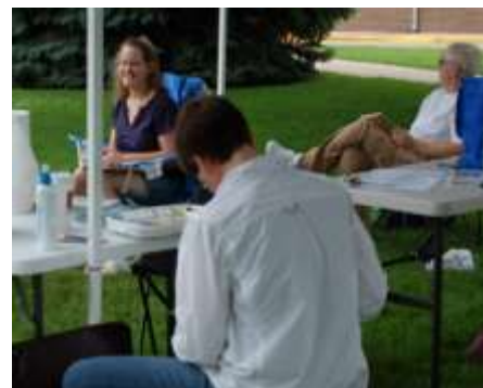
Downtown Paint Out