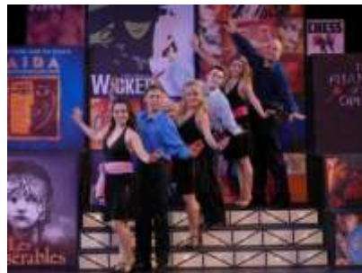
On Broadway A Modern Songbook