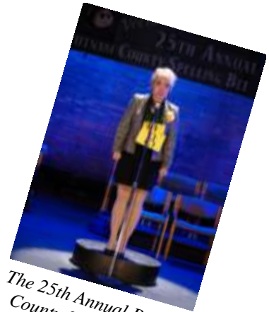
The 25th Annual Putnam County Spelling Bee