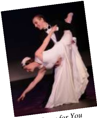
Crazy for You