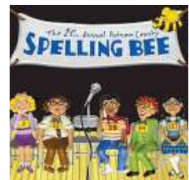
Cast album (copyrighted)

Art idea: Children's art. Possible images: blackboard with letters, caricatures